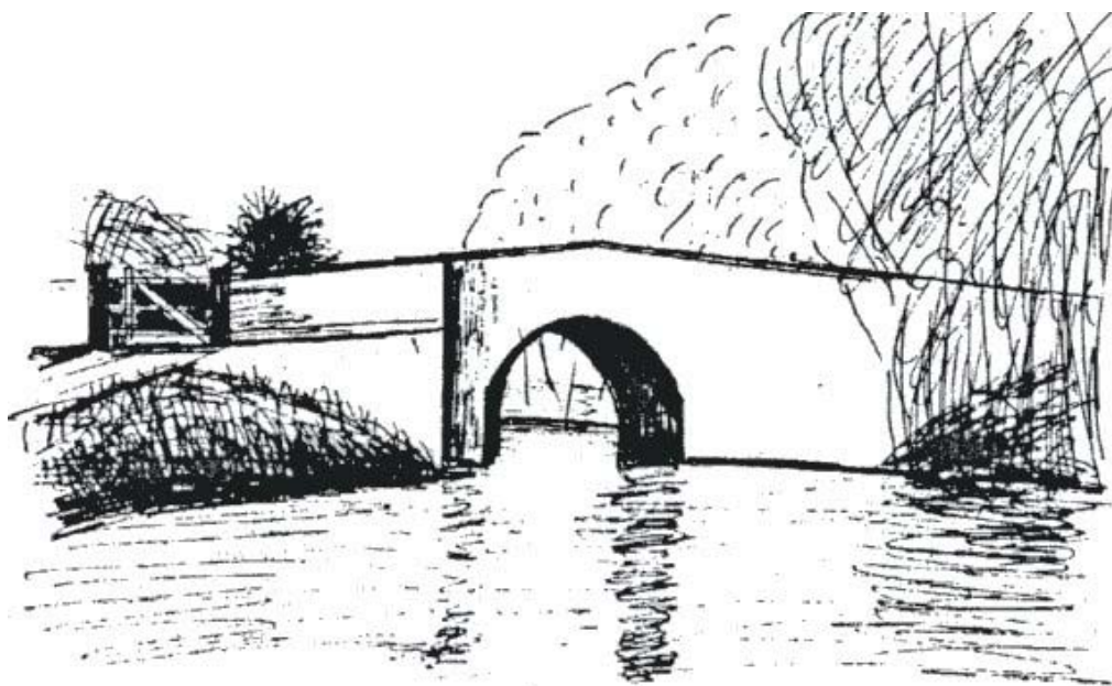
The new Radcot Bridge, built in 1787, over the navigation cut